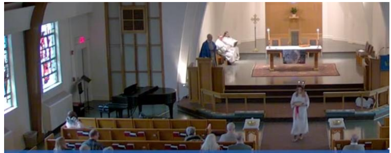
The Witness of Sankta Lucia