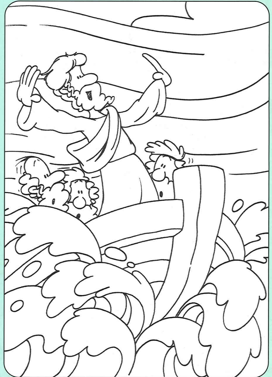
He awoke and rebuked the wind and said to the sea, "Peace! Be still!" Mark 4:39

In the space below, draw a picture of something that frightens you.